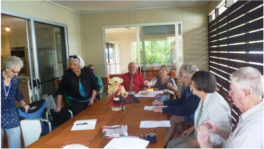
After the meeting we went to the Gateway Café for lunch.