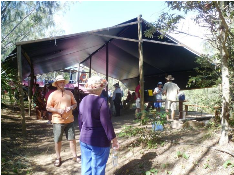
Morning tea break

The view was amazing as we looked right back around the bays to Agnes Water in the distance.