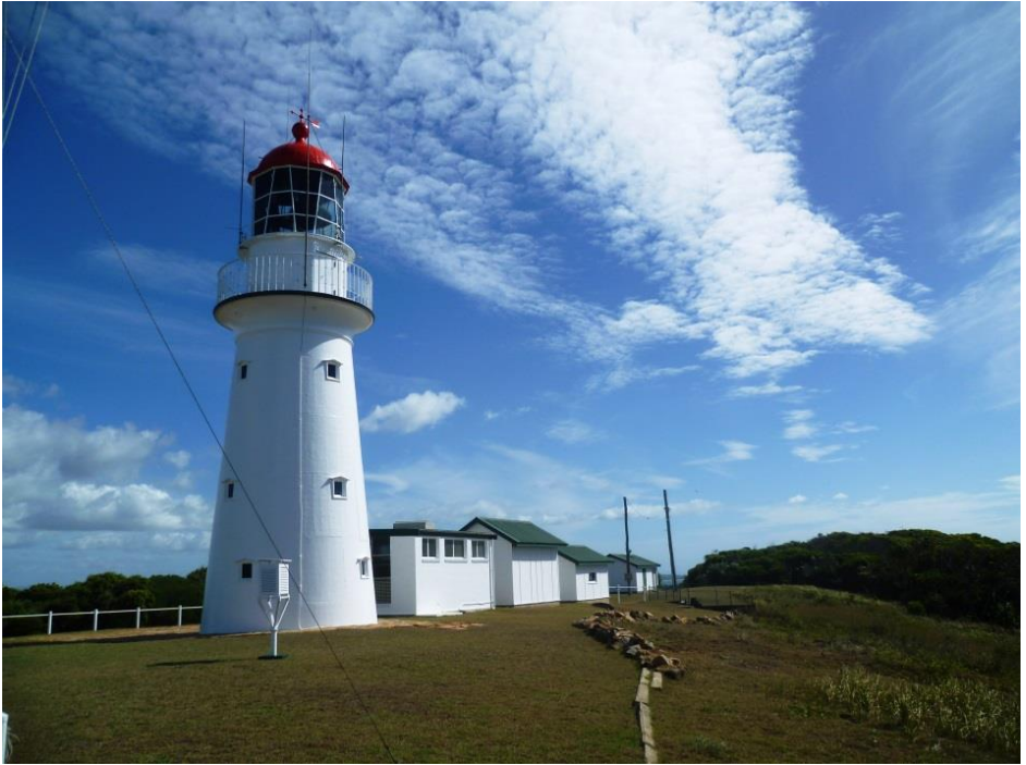
The Lighthouse on Bustard Point

We learnt a lot about the lighthouse and the families who lived there over the years. It is automated now, but families bid for residency time to oversee the facility and tourist visits. Bustard Point was named by Cook as he travelled north.