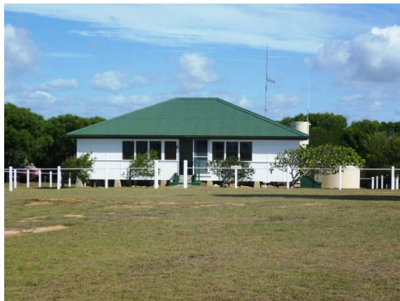
The house held a museum of life at the Lighthouse

We learnt a lot about the lighthouse and the families who lived there over the years. It is automated now, but families bid for residency time to oversee the facility and tourist visits. Bustard Point was named by Cook as he travelled north.