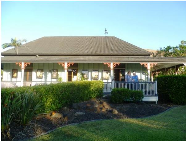
The original home at the Rum Factory