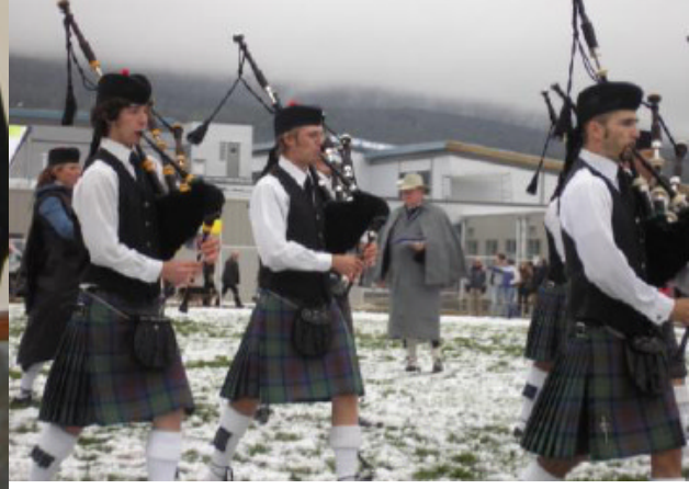
Believe it or not, A Rocky Mountain summer morning!