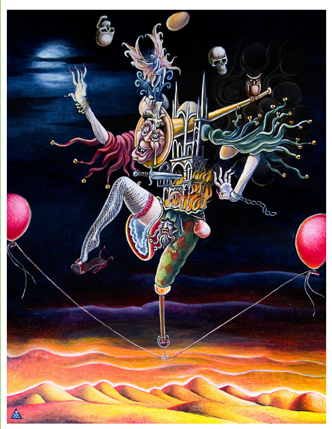
"Lord of Misrule" Oil on Panel 2008 by David Normal

It is traditional for Twelfth Night celebrations to include the consumption of a cake. In Scotland, it was the Black Bun cake. A bean was baked in the cake, and the finder of the bean would run the feast, and be named the "Abbot of Unreason", known elsewhere as the "Lord of Misrule". This is all meant to symbolise