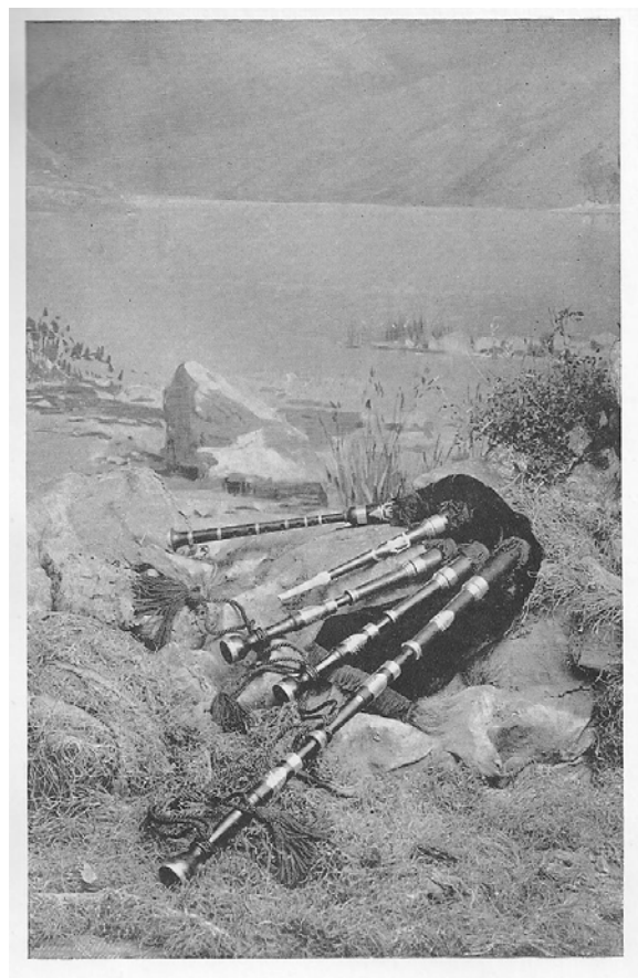
FEADAN DUBH CHINTAILLE OF BLACK CHANTER OF KINTAIL.

The stock of the blowpipe has the following inscription:— "This silver-mounted black ebony set of bagpipes with the Feadan Dubh Chintaille, was the property of Lord Seaforth, Baron Mackenzie, High Chief of Kintail, 1797," and on the blowpipe itself is the figure of a Highlander, in silver, in full costume, with drawn claymore, surmounted by the motto, "O Thir nam Beam) ' (from the land of the mountains).