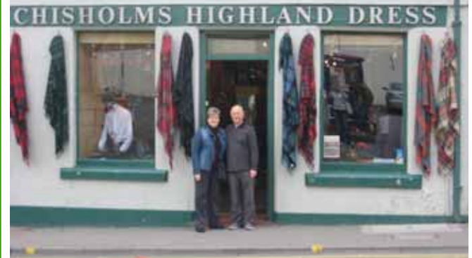
Random on-line review

Linking with other Chisholm families to form distinct genetic families with thin Clan, and then beyond the Clan era, looking back at an ancestral past which may incorporate the Normans, the Vikings, the Gaels, the Britons, the Picts, or the unknown mystery, awaiting discovery. This project is operated out of Houston Texas, but is administered in little old new Zealand, contact the editor to take part, or visit the project website. http://www.familytreedna.com/public/Chisholm/default.aspx