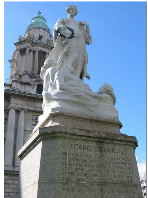
Titanic Memorial, City Hall, Belfast: