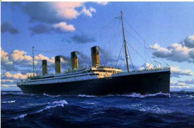
RMS Titanic April 14, 1912