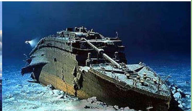
RMS Titanic April 14, 2012